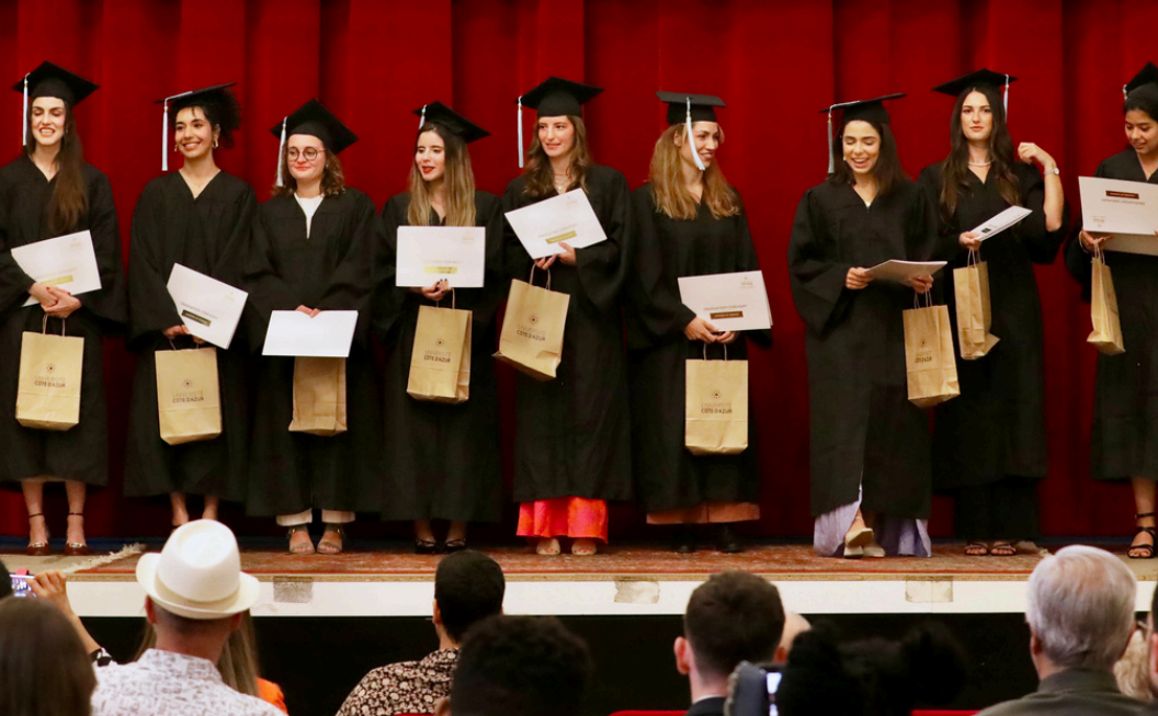
Our 2023 students at their graduation ceremony